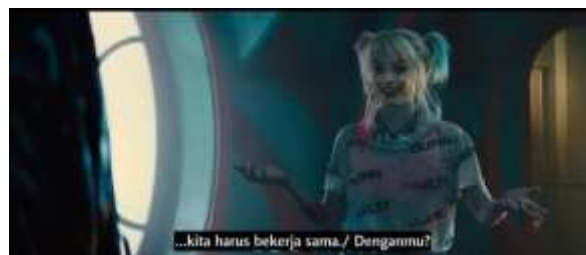
Figure 11 Harley Persuade her friends to work together

Harley Quinn and other women accidentally meet in a building where she will hand Cassandra to Zionists, feeling they have the same goal, they work together. Of course, to face the oppression of Roman Zionist and his accomplice Victor Zsasz (in frame 11)