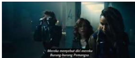
Figure 13 Birds of Prey against criminals

After the Zionists died, Harley Quinn and her friends decided to clean up Gotham City from the inside and outside. Seen when they carry out their actions to fight criminals (in frame 13)