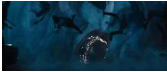
Figure 12 The voice of Black Canary defeating the enemy

Seen the sound of the black canary was able to defeat the Zionist and make the Zionist troops bounce. Cooperation and mutual trust are very visible in this film like what did Renee Montoya said to Harley “ Don't let them catch kid, I trust you. ” From the dialogue, Renee Montoya gives a gun with one bullet to Harley. Renee trusts Harley if she will use the gun well. By working together and trusting each other that Harley Quinn and her friends do, they can defeat the Zionists. This success proves that the power of women cannot be underestimated. Even against a Zionist army consisting of a group of men, women who are considered weak actually have an inner strength that can defeat anything if used properly and cooperated.