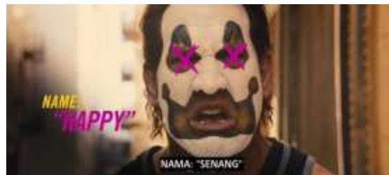
Figure 7 Mr. Happy who wants to catch Harley Quinn

In pursuit of Renee Montoya, Harley said “Since my little stunt at Ace Chemicals announced to the world that Mr. J and I were dunzo. The immunity I’d enjoyed, for so long was gone. Cops who never would’ve dared come after me before were suddenly doing this.” Even so Harley still escapes and proves her ability to survive without the influence of the Joker. While she was still being chased by police Renee Montoya for her crimes, each of the people she had harmed attacked her. The first is a Dummy Roller whose nose was broken by Harley Quinn during an ice-skating match. The second is Ralph Murray who was bitten by her new Hyena. And the last one is the driver of Roman Zionists because Harley has broken his leg. Harley hangs on to the roof of the building using both her hands with a smiling expression after successfully escaping from Renee, Ralph Murry and Roman Zionist’s driver who chases her. When she thought she could escape from the people chasing her, it turned out that there was still Mr. Happy waiting for her because of cosmetics vandalism (in frame 7)