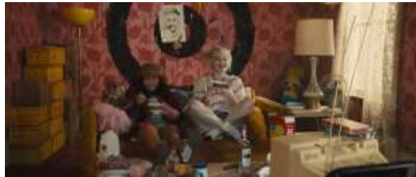
Figure 10 Harley treats Cassandra well

to take the diamond contained in Cassandra Cain's body. Harley treated Cassandra well when she kidnapped her from prison (in frame 10)