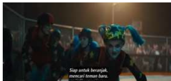
Figure 3 Harley playing skating with her new friends

In this scene Harley said “But after a while, I even opened myself up to the possibility of new love” . Harley Quinn also started her new life by making new friends and doing new activities. She goes to an ice-skating match to try to forget her troubles (in frame 3)