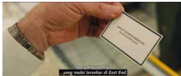
Figure 15 Business card with new identity of Harley Quinn

Finally, after defeating Zionist and getting the diamonds exchanged for money, she finally found what she wanted to do, she founded her own company. There is no mention of what Harley Quinn's business is, but she finds that her company is called "Harley Quinn & Associate", as shown in the business card at the end of the story (in frame 15)