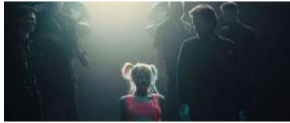
Figure 8 Harley caught by Roman Zionist

Having no protection from the joker, Roman Zionists thought it would be easy to kill Harley. As in his statement “I wanna kill you, because without the joker around, I can. For all your noise and bluster, you're just a silly little girl with no one around to protect her.” But in her arrest Harley did not give up, she tried to persuade the Roman Zionists by offering to help find the lost Zionists item that is diamond.