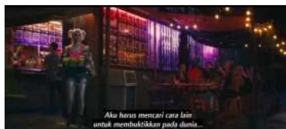
Figure 4 Harley is underestimated by her friends

After Harley Quinn breaks up with Joker, she still uses the Joker name for the sake of the immunity she gets.