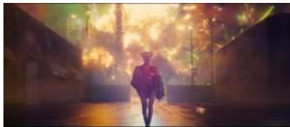
Figure 5 Harley Quinn blowing up the chemical factory to declare her breaking up with Joker

Hearing the gossip of her friends Harley is very sad to be underestimated, but she proves her independence by finding a new identity. Harley Quinn, who was so devastated, wanted to show her emancipation that she could be alone without the Joker's protection. While she was drunk, she got a crazy idea that is blowing up a chemical factory where Joker and Harley start their love story. The chemical factory is where the love story of Harley Quinn and the joker begins. In order to erase the traces of their love story and throw away the good memories with Joker, she closes her messy relationship by throwing away her J necklace and crashing an oil truck driving into a chemical factory where she drowns with Joker, causing it to explode and the entire factory catches fire (in frame 5).