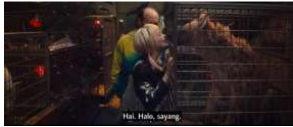
Figure 2 Harley in animal shop

When a person experiences deep sadness then she will find a way to heal her inner wounds, by doing something pleasant. Everyone has a different way of healing their mind. So that each person must recognize herself and see what must be done to speed up the process of inner healing and start a new life. In this scene, Harley is a person who recognizes herself so that she can choose what to do, that is by adopting a Hyena.