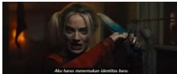
Figure 1. Harley Quinn cutting her hair declaring her path of new self-discovery.

At the beginning of the movie, she cut her hair short, as if she was about to break away from the past and start again (in frame 1).