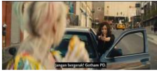
Figure 6 Harley being chased by police Renee Montoya Source : Screenshot of the screen

In pursuit of Renee Montoya, Harley said “Since my little stunt at Ace Chemicals announced to the world that Mr. J and I were dunzo. The immunity I’d enjoyed, for so long was gone. Cops who never would’ve dared come after me before were suddenly doing this.” Even so Harley still escapes and proves her ability to survive without the influence of the Joker. While she was still being chased by police Renee Montoya for her crimes, each of the people she had harmed attacked her. The first is a Dummy Roller whose nose was broken by Harley Quinn during an ice-skating match. The second is Ralph Murray who was bitten by her new Hyena. And the last one is the driver of Roman Zionists because Harley has broken his leg. Harley hangs on to the roof of the building using both her hands with a smiling expression after successfully escaping from Renee, Ralph Murry and Roman Zionist’s driver who chases her. When she thought she could escape from the people chasing her, it turned out that there was still Mr. Happy waiting for her because of cosmetics vandalism (in frame 7)