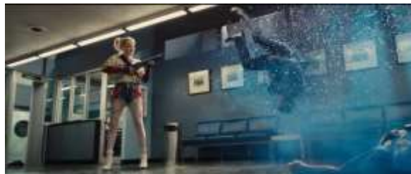
Figure 9 Harley uses colorful bullets Source: Screenshot of the screen

In Feminism struggling does not mean being hard on ourselves but we also have to look at the situation in order to solve the problem. When Roman Zionist gives Harley a chance to find the diamond and set it free Harley said “Call me old-fashioned, but I always thought the guy was meant to get the girl a diamond.” From the statement it is implied that men should bring diamonds for women, but not what Harley Quinn should do. She had to find diamonds to turn over to the Roman Zionists. This proves that the Zionist army consisting of men was unable to get the diamond in Cassandra's hands, so Harley needed to intervene to get it. Harley is also being sought by the police for one of her actions. Although Harley had to stealthily look for the diamond that Zionists wanted, Harley passed it casually. She continued to do so madly and carelessly.