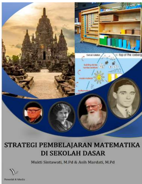
Figure 3. Book's cover